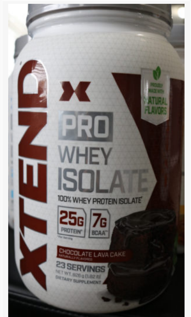
Not just chocolate, but chocolate lava cake . We’re hoping for a ‘dank’ one!

Xtend Pro starts with an Instantized Whey Protein Isolate “blend” which contains whey protein isolate and sunflower lecithin . Whey protein isolate is the more highly-refined and filtered form of whey protein that’s typically around 90% protein by weight. The filtration removes more of the lactose (milk sugars), fats, and even ash from the product, making it friendlier to lactose-sensitive consumers.