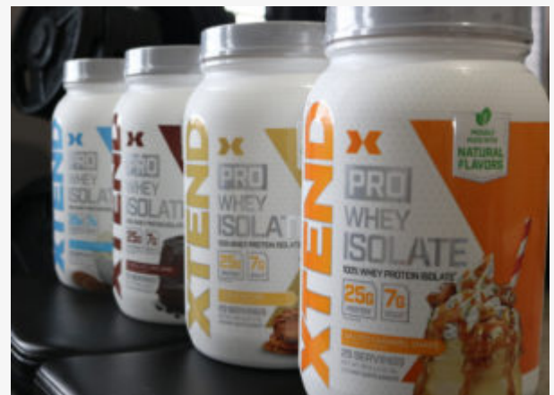
Xtend Pro is the first new product in the Xtend rebrand, and it's a 100% Whey Isolate launching with four flavors!

It's been a year and a half since Nutrabolt bought Scivation, the company behind the Xtend BCAA supplement, and things have really kicked into high gear as 2018 comes to a close.