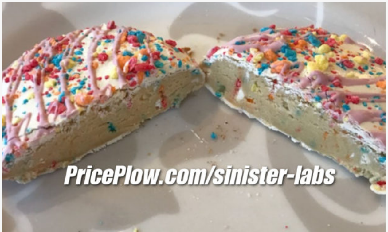
The Birthday Cake flavor is the odds-on favorite so far!