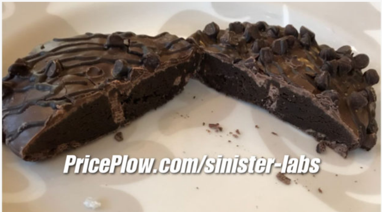
Chocolate chocolate chip, not just “chocolate chip”

But the product line is still wide open for a “regular” chocolate chip cookie!