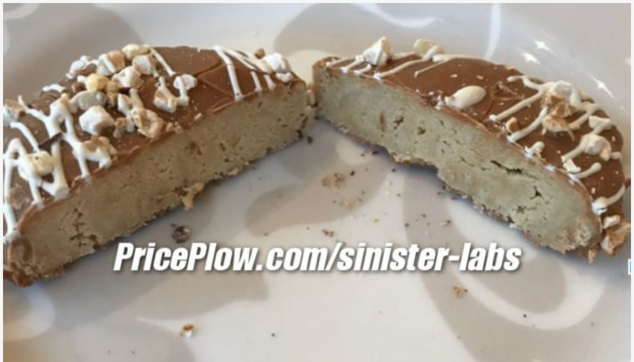
Angry Mills does peanut butter right!