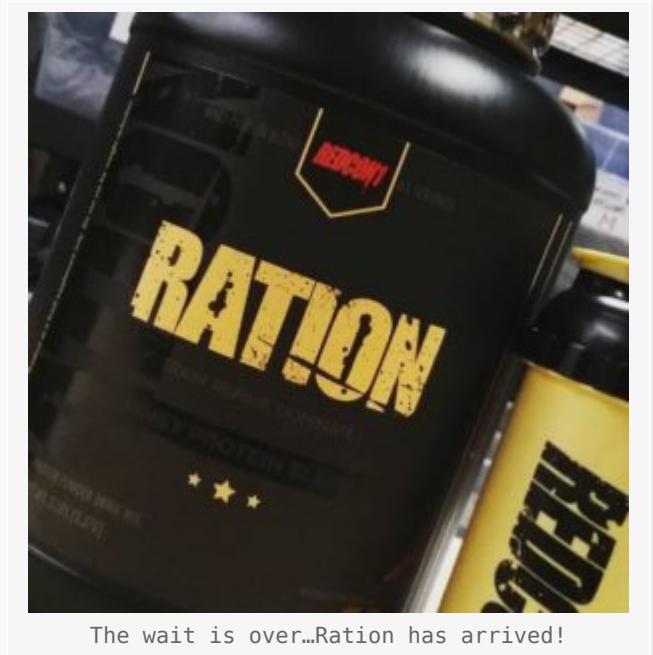
The wait is over...Ration has arrived!

RedCon1 launched Ration with just one flavor – Chocolate . However, the brand revealed two other flavors to come shortly after, giving a total of three flavors: