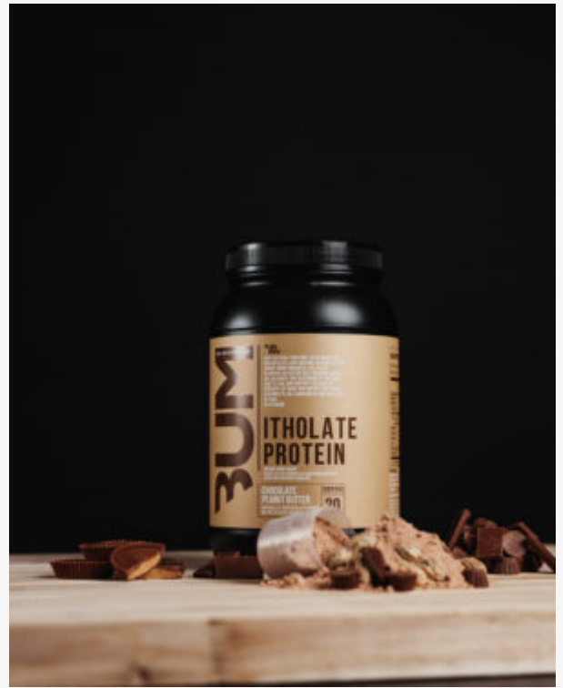
CBum Itholate comes in a few other awesome flavors, like Chocolate Peanut Butter

CBum Itholate also comes in some other excellent flavors. Check them out below: