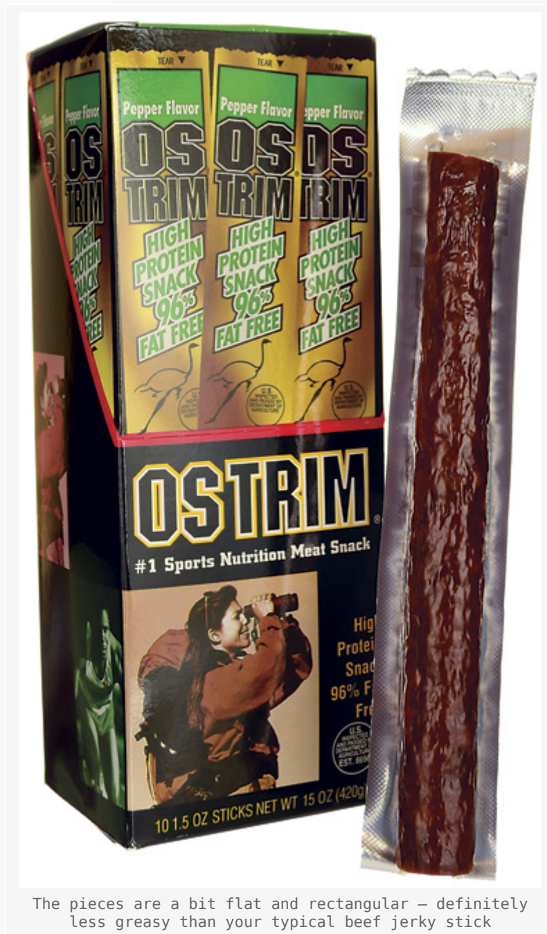
The pieces are a bit flat and rectangular – definitely less greasy than your typical beef jerky stick