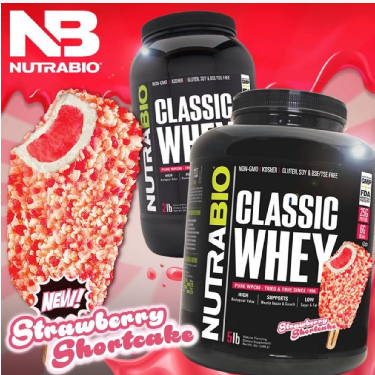
NutraBio Classic Whey now comes in Strawberry Shortcake flavor!

That's right, the legendary NutraBio Classic Whey now comes in Strawberry Shortcake !