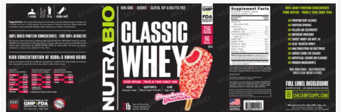
The full NutraBio Classic Whey Strawberry Shortcake Label

Posts are sponsored in part by the retailers and/or brands listed on this page.