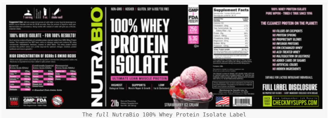
The full NutraBio 100% Whey Protein Isolate Label

Posts are sponsored in part by the retailers and/or brands listed on this page.