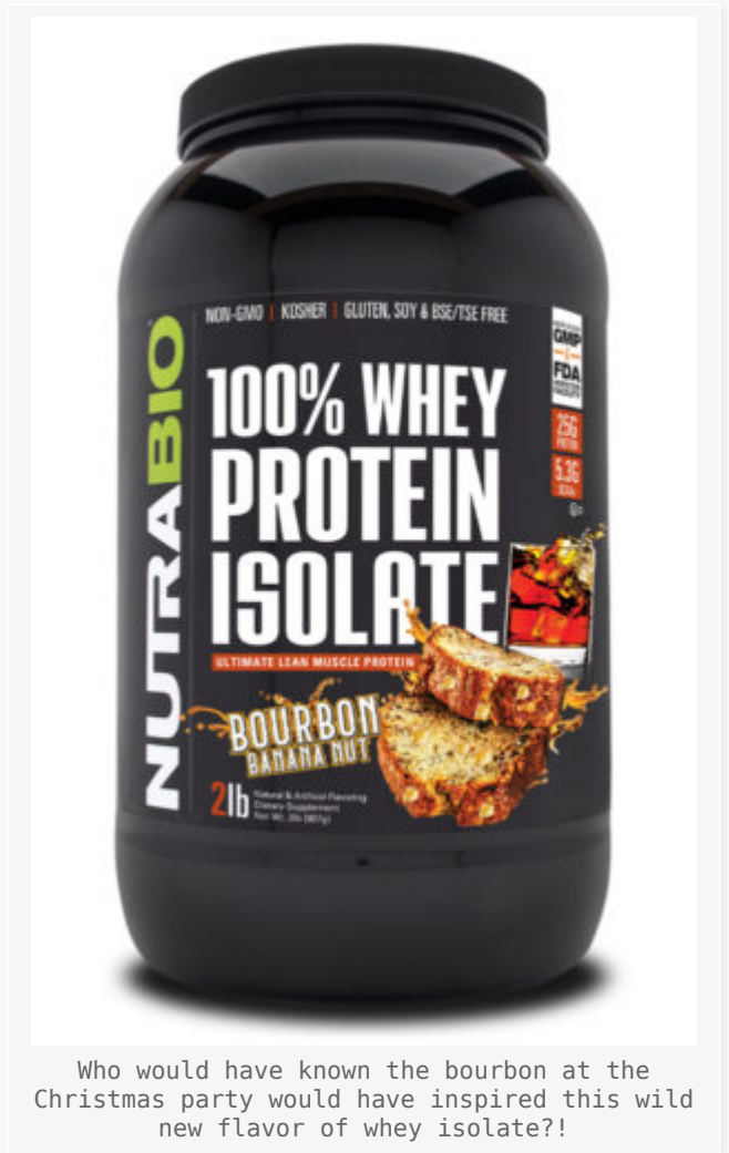
Who would have known the bourbon at the Christmas party would have inspired this wild new flavor of whey isolate?!