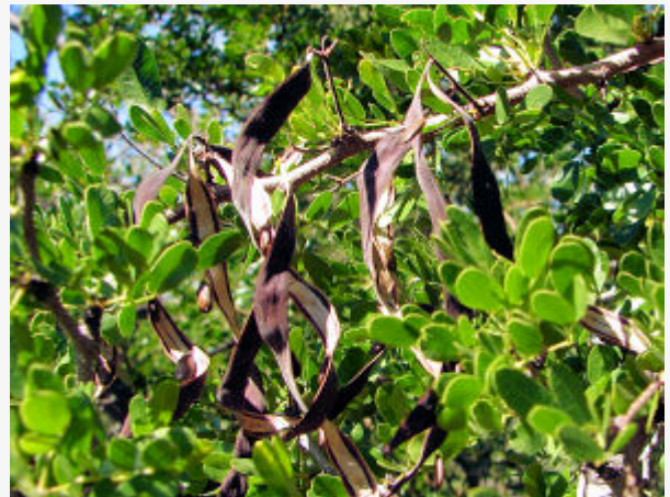
This Southern Texan plant, Acacia Rigidula , contains some incredible fat burning and mood-enhancing compounds. We wouldn't at all be surprised if methylsyneprine was one of them, given that it has nearly everything else.

While one study goes so far to say that "Methyl-syneprine is purported to occur in nature, does not occur in bitter orange extract, and is of synthetic origin in this product and other products that have been marketed," [12] that doesn't preclude it from being in other plants. Bitter orange is simply the most common place to find regular syneprine.