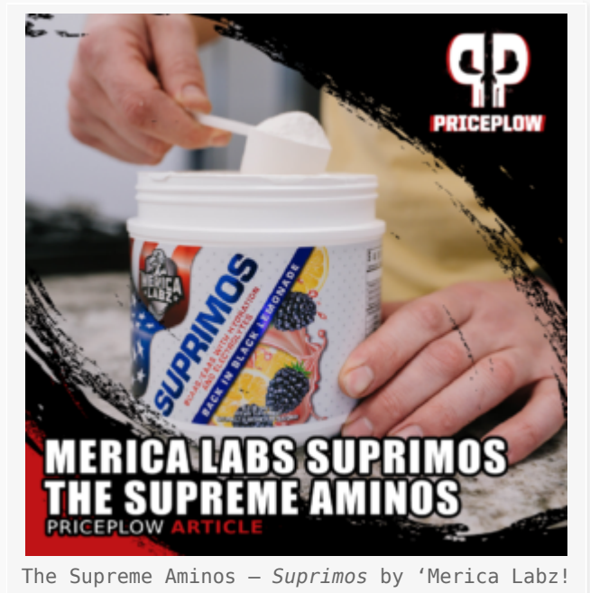
The Supreme Aminos – Suprimos by 'Merica Labz!