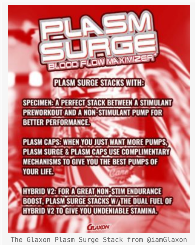
The Glaxon Plasm Surge Stack from @iamGlaxon

On one hand, you may be cautious when seeing a pre-workout supplement that's not a traditional fruity flavor. But on the other hand, you've got all year to drink fruit punch pre workout – why not try something different? Especially if that "something different" leaves you with great breath!