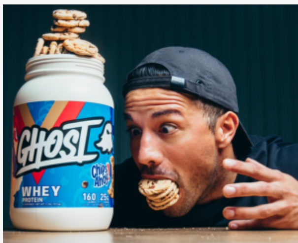
Can Nutter Butter top Chips Ahoy?!

Nutter Butters are rightfully known as the “ peanut butter lovers’ cookie ”. It consists of two peanut butter cookies with a dense, rich, and flavorful peanut butter filling. You could say it’s a bit of a peanut butter overload, but that may not be such a bad thing!