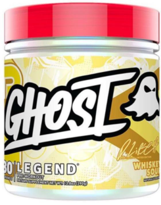
Ghost Legend Whiskey Sour has arrived but only for a limited time!