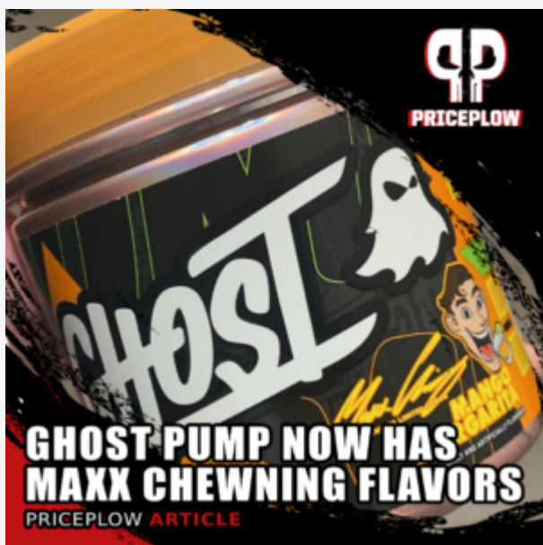
Ghost Pump Maxx Chewing is finally here!

Ever since Ghost started doing flavor collaborations with their sponsored athletes, the products instantly became a hit with Ghost fans. Ghost typically launches a limited edition version of Ghost Legend just a few times per year and the products are always slightly different, and the formulas keep getting better.