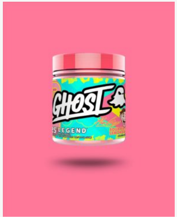
Ghost Legend Sour Pink Lemonade is back for 2021!