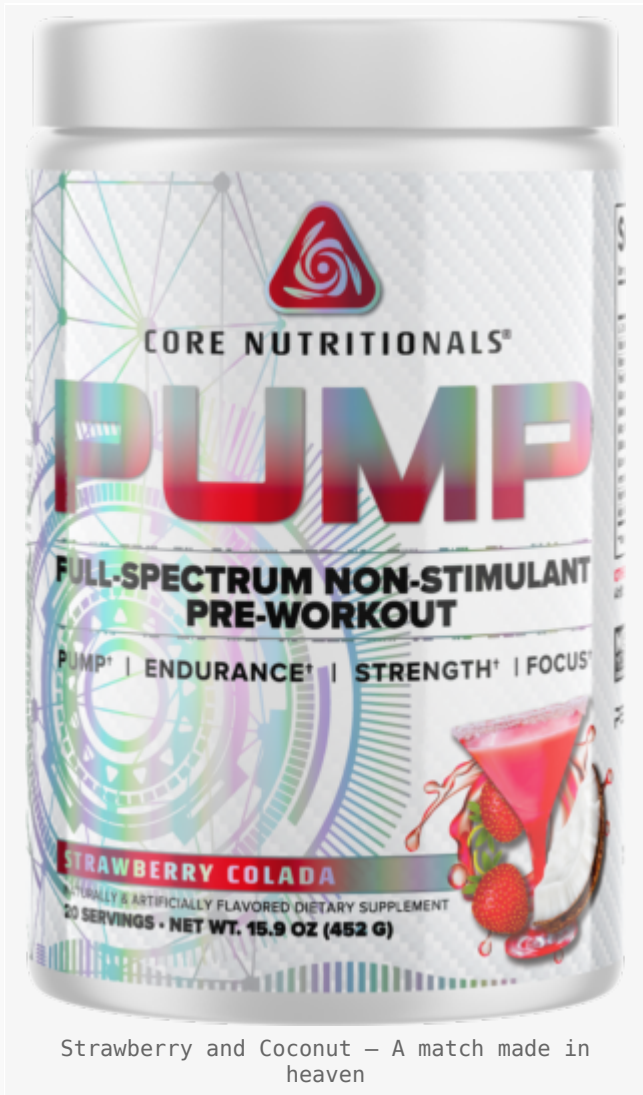
Strawberry and Coconut – A match made in heaven

Pre-workout supplements have a short-term use profile compared to other supplements like creatine or whey protein, meaning users want to notice it quickly and strongly. People want a great workout and they want to feel good during it.