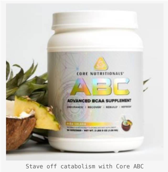
Stave off catabolism with Core ABC

Also worth noting: Lemon Lime Sherbet first came out in the Core FURY pre-workout supplement.