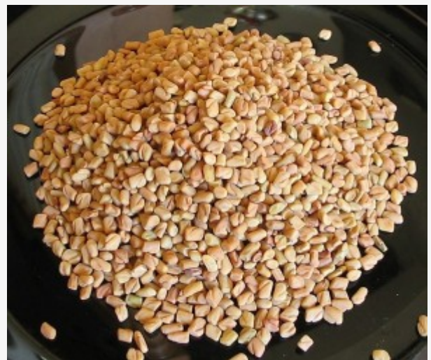
These goofy-looking fenugreek seeds provide a huge plethora of benefits, including a moderate increase in testosterone levels

Research seems to be mixed on the effectiveness as Fenugreek as a potent testosterone boosting product, but that doesn't mean it's without merit. The one study that did show Fenugreek to improve T-levels also showed a decrease in body fat among the test group.[5]