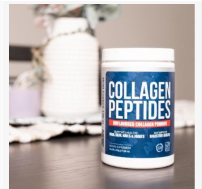
Promote skin, hair, nail, and joint health with AMN Collagen Peptides!

Dige-Pro is a digestive enzyme and probiotic blend formulated to enhance nutrient absorption and support a healthy digestive system.