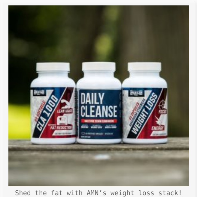
Shed the fat with AMN's weight loss stack!