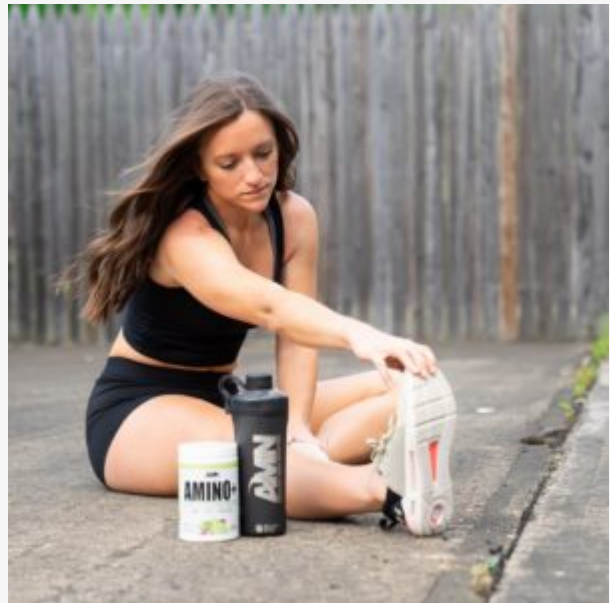
AMN is a brand that's passionate about both health and performance!