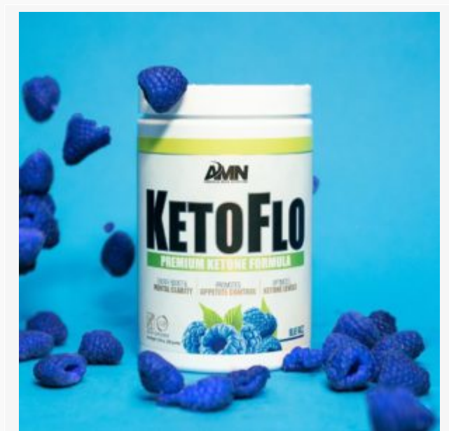
Fuel your body with KetoFlo from AMN!

For everyone out there following a ketogenic or low-carb diet – or you're even looking for an "alternative fuel source" to add to your carbs – KetoFlo is the product for you!