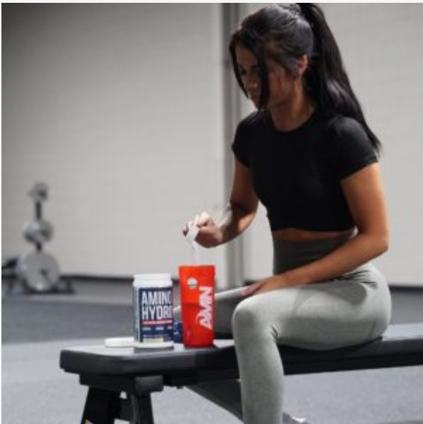
Fuel your health and performance with AMN Supplements!

However, AMN has become successful because they offer products that suit nearly anyone's goals or dietary needs. From protein powders, amino acids, and multivitamins to weight loss supplements and single ingredient products, AMN has it all.