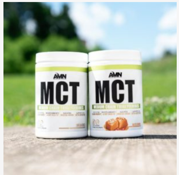
A premium MCT Powder that's extremely versatile!

The last product in AMN's all-natural line we're going to discuss is AMN MCT Powder – their premium medium chain triglyceride powder that comes in both unflavored and flavored variations, including Salted Caramel!