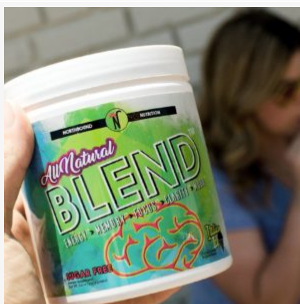
With Blend in hand, you'll always have the mental willpower and focus to stay on task.

As we've seen with the other energy-based supplements from Northbound, they've again opted for Organic caffeine derived from green coffee beans. Users of the original Blend will note that the caffeine content has been substantially lowered from 215mg to 125mg here in the all-natural version.