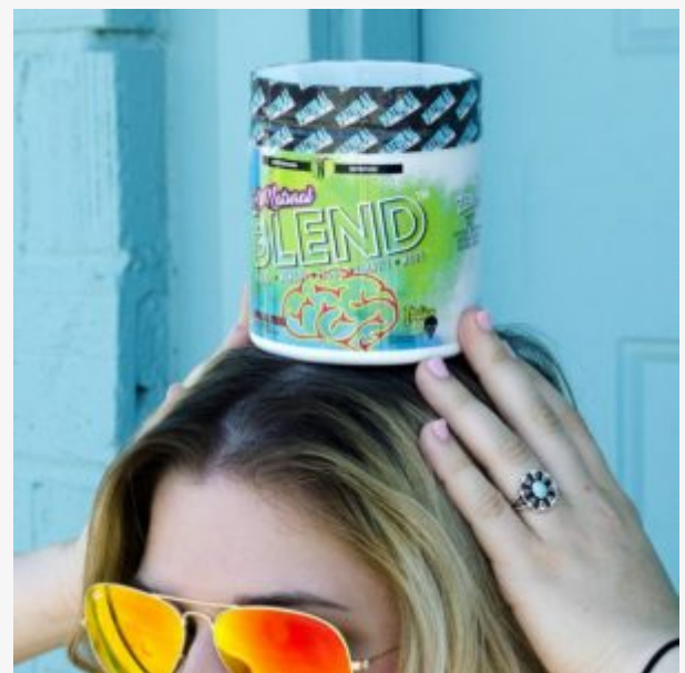
All-Natural Blend on the mind with not-so all natural hair.

The All-Natural Blend is currently available in three flavors: